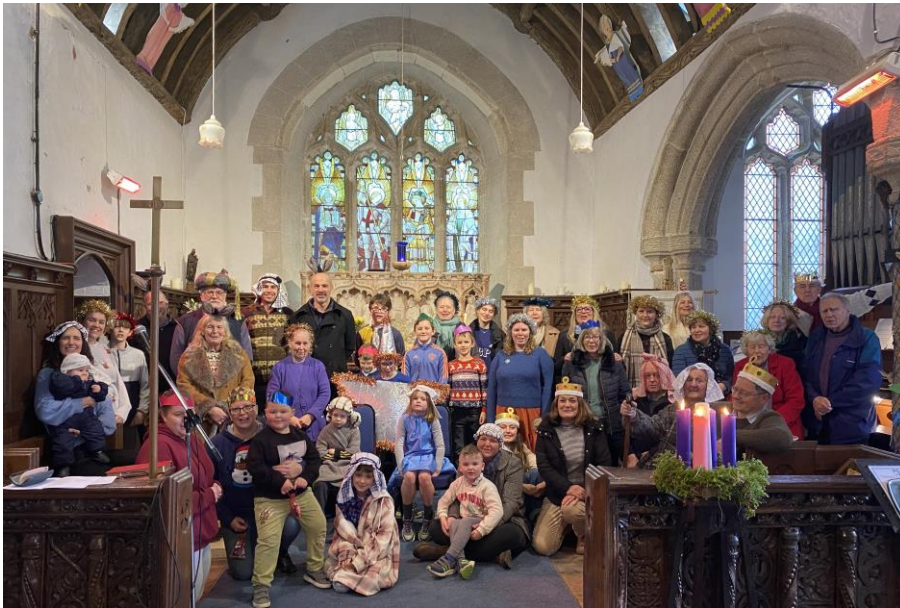
Some of the congregation at the Christmas Nativity and Carols at St Mary Bradoc Church