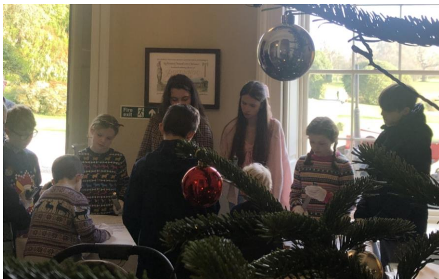
Ten of our hand chime ringers at Boconnoc December Christmas fair.